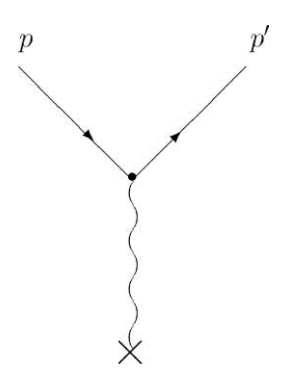
Fig. 2. The main contribution to the potential scattering of an electron.

In more technical terms, the story so far amounts to this: let k be the 4-momentum of the virtual photon, and let p be the momentum of the incoming electron with bare mass m_0 and bare charge e_0 . 4-momentum